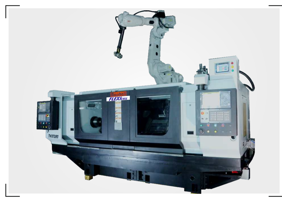
Robot can load/unload 4 turning Spindles, Clean, Inspect and also Load on other Machines for subsequent operation.