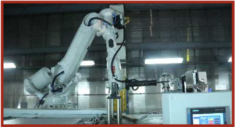
Inspection & Auto Correction with <u>SmartCorrect</u>