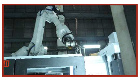
Job cleaning station